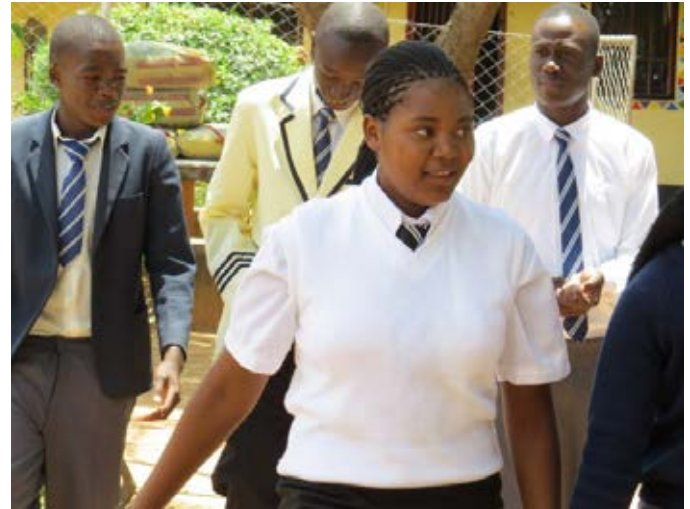
Mhondoro High School Choir

RioZim Foundation recognises that we cannot consider the health and nutrition of the child without also considering the health and nutrition of the mother. It affirms its commitment to the principles of good nutrition and primary health care and will aggressively pursue strategies to improve these for children and their mothers over the next three years.