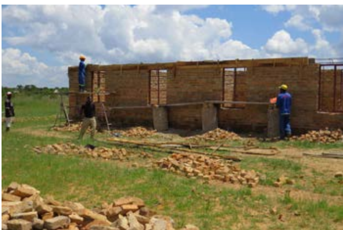
Mhondoro High School Dormitory for Girls: Keeping vulnerable girls in school, January 2014