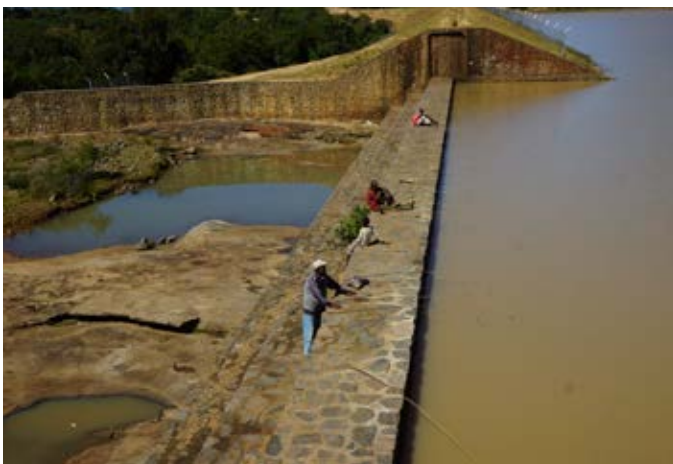
Tugwane Dam: Fishing for livelihoods