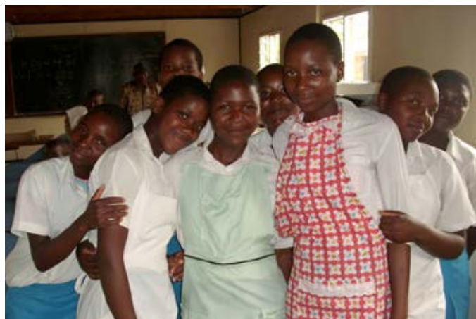
Mhondoro Girls High School Class

Their need was for a reliable source of water: a dam of sufficient size to support an irrigation scheme which could be used as the motivation to develop the growth point in the area. The Foundation undertook to address this need with a project which was to be its biggest to date.